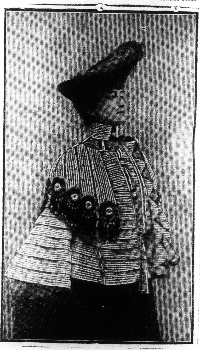
Modish Tucked Coat.

you've got. Henpeck-Not at all. This is my house