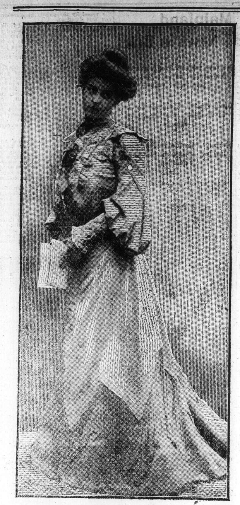
Effective Use of Fringe on Cloth Gown. (Lebouvier.)