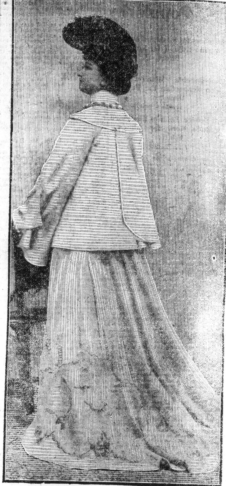
Cloth Costume in Pastel Coloring. (Bechoff.)

Good Old Lady—I wouldn't smoke cigar ettes if I were von little boy! Diminutive Mucket—Ap' I wouldn' smoke em if I was you. - Harvard Lam-