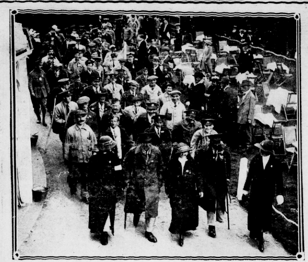
BRITISH SOLDIER CRIPPLES, COLORED AND WHITE FEASTED AT HAMPTON COURT

Two stalwart black soldiers of King George, who were leading features of a wounded parade from autos which brought them from hospitals to Hampton Court, near London, recently, to be entertained by a club there. They are all a jolly lot of cripples.