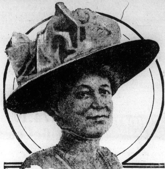
MRS. TAFT, WEARING HER NEWEST HAT.

Mrs. Taft has decided views on fashions. The extravagance in hats met with his disapproval long ago.