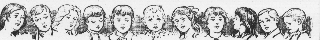
SOME OF THE 149,230 REASONS WHY THE FUND NEEDS SO MUCH MONEY

THE CANADIAN PATRIOTIC FUND, VICTORIA STREET, OTTAWA