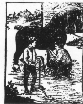
Stewart No. 1, Ball Bearing, Horse Clipping Machine in Operation.