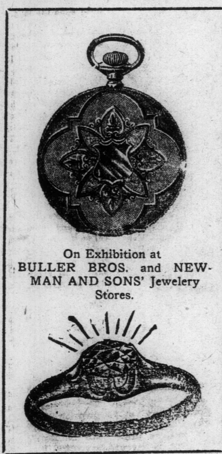
On Exhibition at BULLER BROS. and NEW-MAN AND SONS' Jewellery Stores.