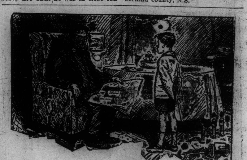
"His Bit." "I was one of the jurymen at an inquest on a Zepp crew."—London Bystander.