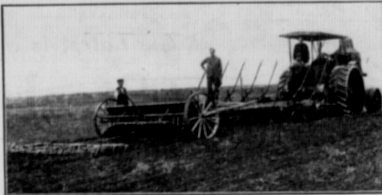
Plowing, Seeding and Harrowing by Tractor