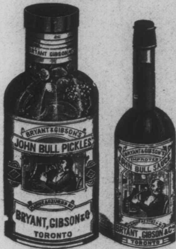
This is a facsimile of our bottles.

BRYANT, GIBSON & Co., TORONTO, Manufacturers of