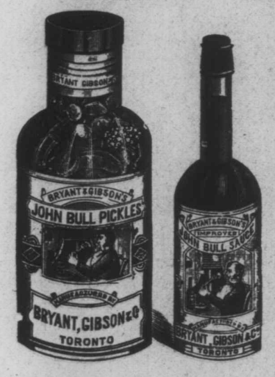
This is a facsimile of our bottles.

"Workestershire Sance," "Yorkshire Sance," "Devoushire Relish" Raspberry Vinegar, Eva-porated Vegetables, Chocolates, Cocoas, Confec-tionery.