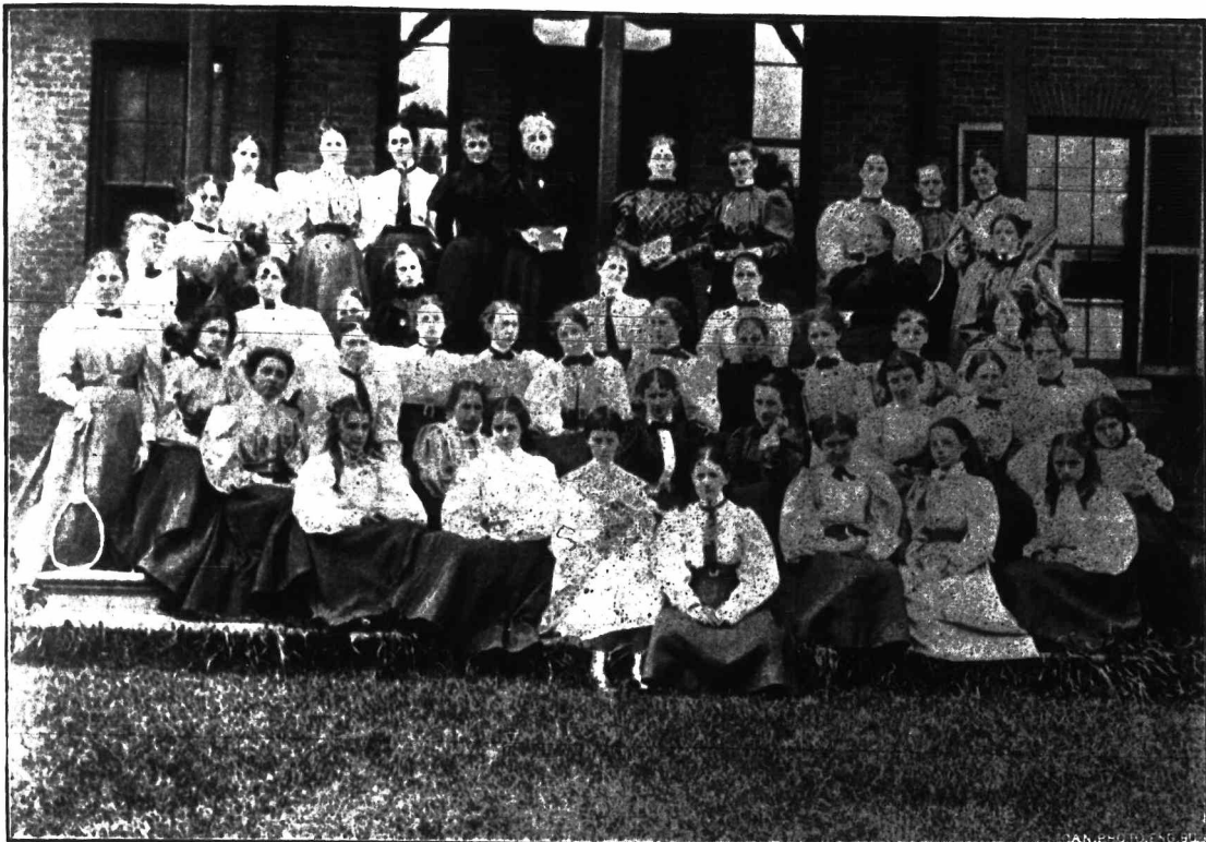
THE BISHOP STRACHAN SCHOOL—A GROUP OF TEACHERS AND BOARDERS.

The ceremonies at the Bishop's House were not the only special services which took place in Iona on St. Columba's Day. Anything like the observance of a saint's day was an abomination to traditional Presbyterianism, but a new school has arisen in the Established Presbyterian Church which seeks to revert in many ways to the pre-Presbyterian Catholic traditions. Under the auspices of men of this school, a sort of pilgrimage to Iona for St. Columba's Day was arranged. The Duke of