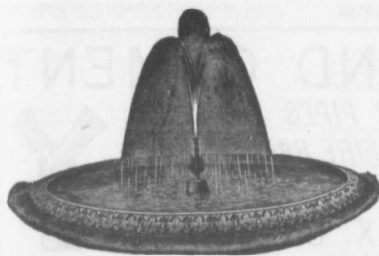
Design No. 1007.

Very Neat and Artistic For Man and Beast.