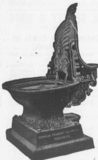
Design No. 1010.

Very Neat and Artistic For Man and Beast.