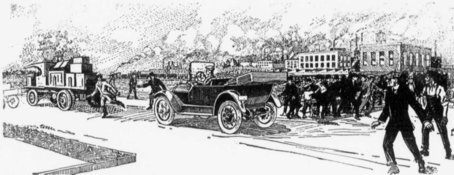
it enables the business man to live away from the city's dust and grime

smelly street cars, with all the danger of contagion that their use involves. You are free from contaminating contact with the scum of the city. You are free from the vitiated, infected, smoke-laden air.