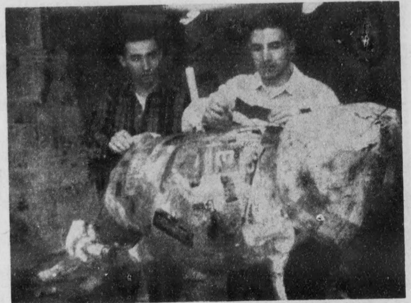
Some of the Jones House boys are shown above creating a weird and wonderful specimen for Carnival competitions.