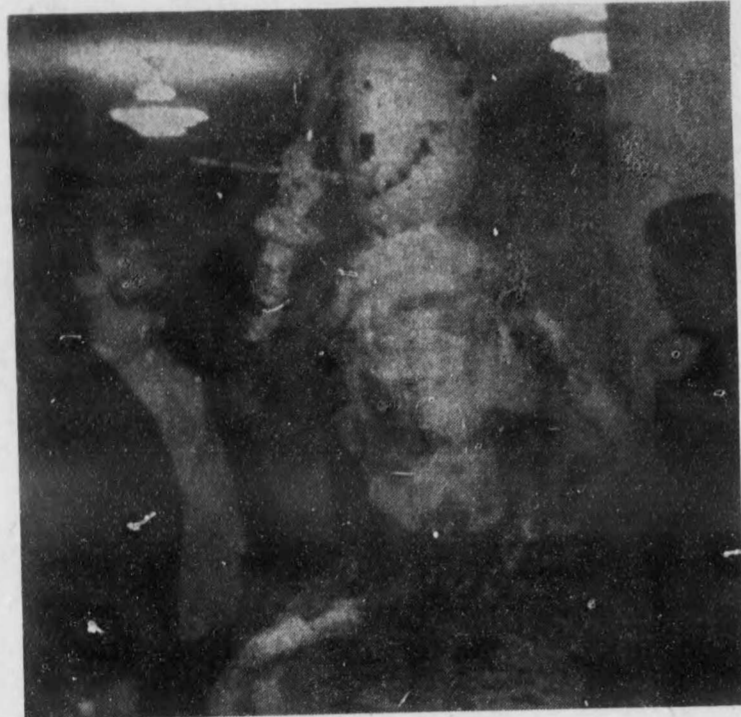
Jones House is well under way in their efforts to cop a Carnival prize.