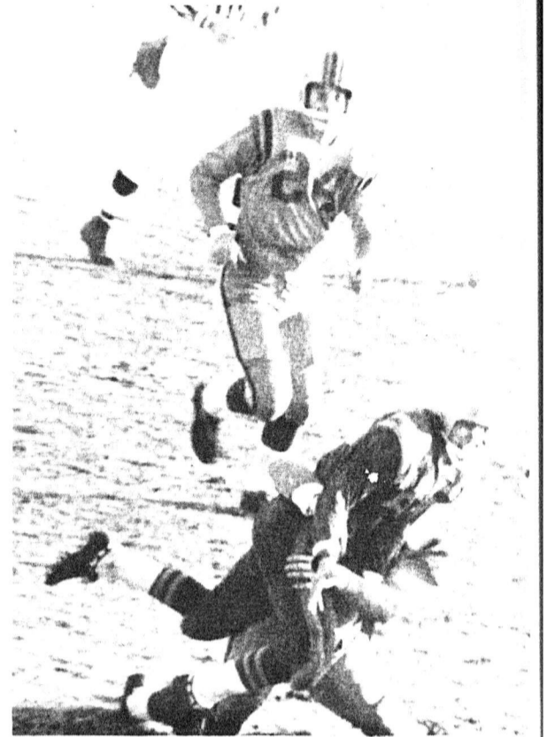
LATERALS TO NIELSEN FOR A TD