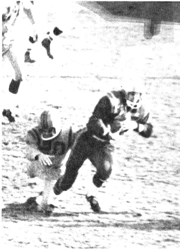
ELUDES WOULD-BE GAEL TACKLER . . .