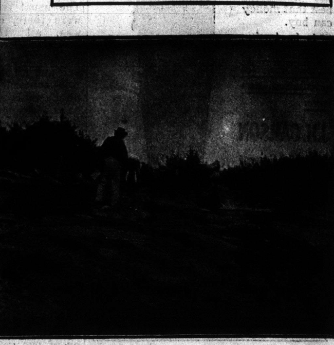
Trekking Homewards.—Scenes on Berens River, Lake Winnipeg. Going up, sixty odd portages are made; returning, half the rapids are run.