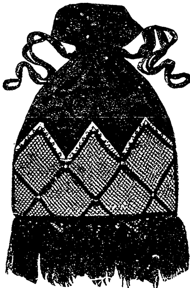
FIGURE No. 2.—SHOPPING-BAG, WITH NETTED BORDER.

To Make the Points.—Net 16, turn, net 15, turn, net 14 and so on. Pick up the st. across the bottom of the bag, netting 2