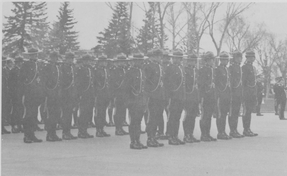
Members of Troop 18-77/78 on the C/S/M's Parade.

What are the future plans for training recruits in French? We anticipate that the Academy will be doing it again.