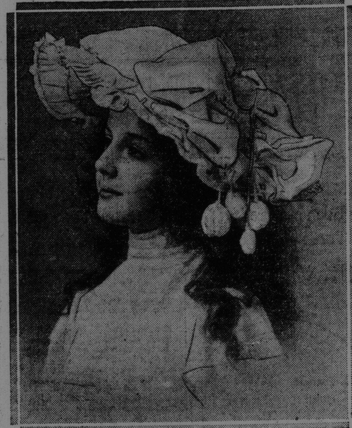
A MODEL FOR YOUNG GIRL.

Just the right hat for the little miss is quite as important a matter as it is for the maid and matron, and the thoughtful mother will carefully select her little daughter's chapeau. This hat is of pale blue satin, with a bunch of jaunty silk knots hanging from a corded cabochon on the right side. Next to the wearer's face are flutings of chiffon and above trimmings of lace.