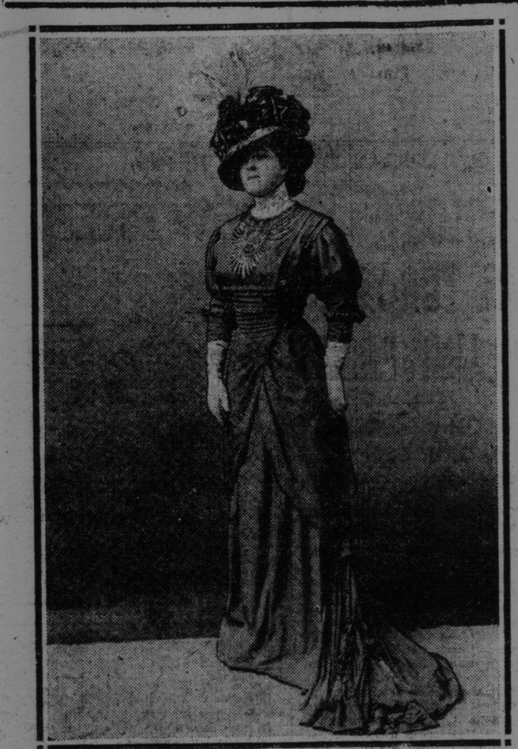
BRIDGE GOWN OF CRIMSON CREPE The model illustrated is one that might very easily be copied by the amateur dressmaker for the design is a simple one, for all its apparent elaboration. Bodice and skirt are separate, the bodice tucked across its lower edge and slightly bloused, being confined at the waist by a girde