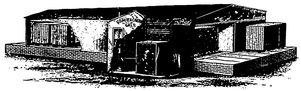
Fig. 1-Progressive Dry Killy.

The company also manufacture apparatus for drying wool, cotton, yarn, cloth, hair, fruit, etc., and for heating and ventilating factories and public buildings. They state that they will gladly send to persons interested Canadian and American testimonials in proof of the efficiency of their apparatus.