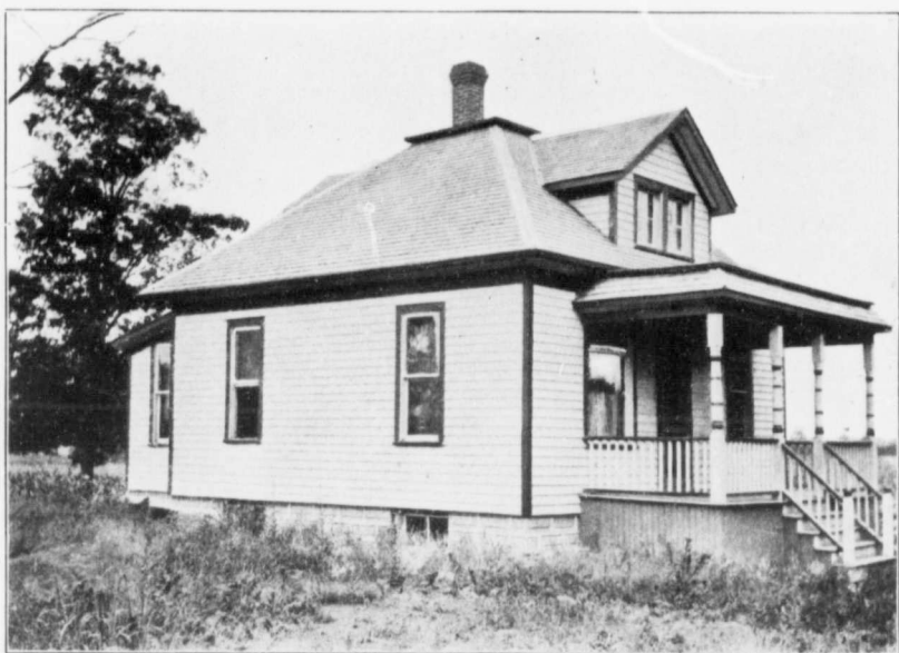
Harrow Experimental Station. Foreman's House.