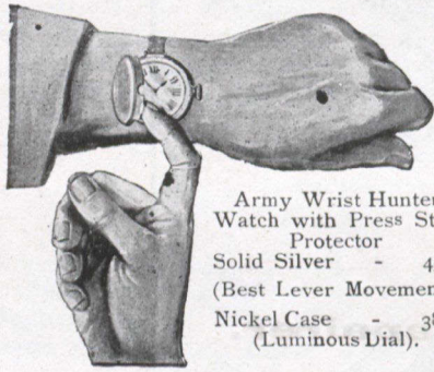
Army Wrist Hunter Watch with Press Stud Protector Solid Silver - 45s. (Best Lever Movement). Nickel Case - 38s. (Luminous Dial).

He carries the Largest Stock of Watches & Jewellery in Bexhill