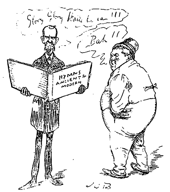
AFTER THE BATTLE.

BROTHER SPENCE, CAROLS A HYMN OF PRAISE.