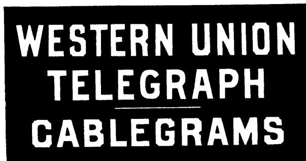
No. 5.—Single, 24 x 12 ins., white letters on blue ground.

Enameled Iron Signs can be made in any shape, size or colors. Blue and white make the most striking contrast.