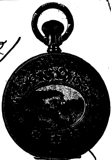
OUR "RAILROAD" WATCH

This Watch is a Perfect Time-Keeper, UNEQUALLED FOR RAILROAD PURPOSES. It has 15 ruby jewels in sunk setting, Compensation Balance, Breguet Hairspring, Patent Pinion, and Regulator adjusted to heat, cold and position, Double Sunk Dial, Stem wind and set. Guaranteed for five years. Fitted to our 14 kt. Gold Filled Hunting Case, warranted to wear equal to Gold for 20 years. Price, $25.00 Cash. Mailed to any address in Canada on receipt of amount; or on receipt of $1.00 we will forward by Express, C.O.D. for balance, with privilege of Examination. The same movement fitted to our 14 kt. Gold Filled, open Face, Screw Bezel and Back Case, guaranteed for 20 years, for $22.00 Cash.