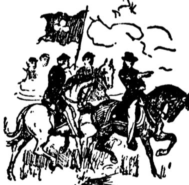
Gen. Hancock and Staff.

Museum of Wax Figures, Chamber of Horror, etc. Admission, 10c.