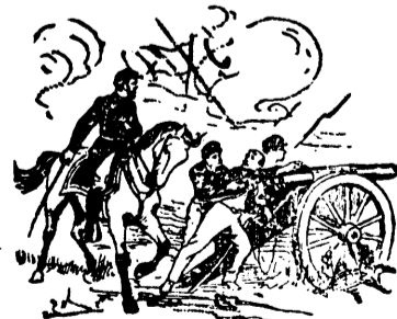
Death of Cushing.