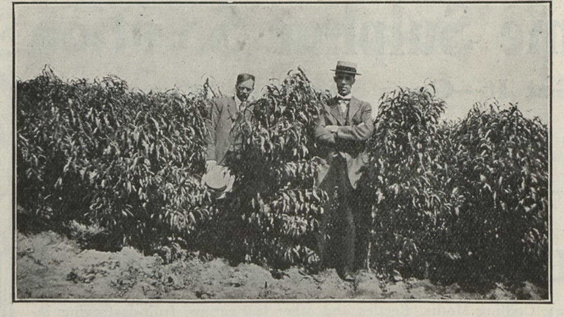
PHOTOGRAPHED IN AUGUST-BLOCK ONE-YEAR PEACH TREES