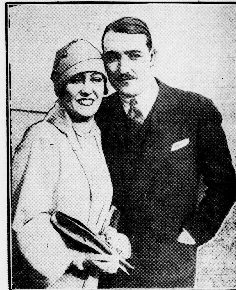
Gloria Swanson, who went abroad a plain commoner to star in a screen production, poses for New York photographers with her titled husband, the Marquis de la Falaise de la Coudray