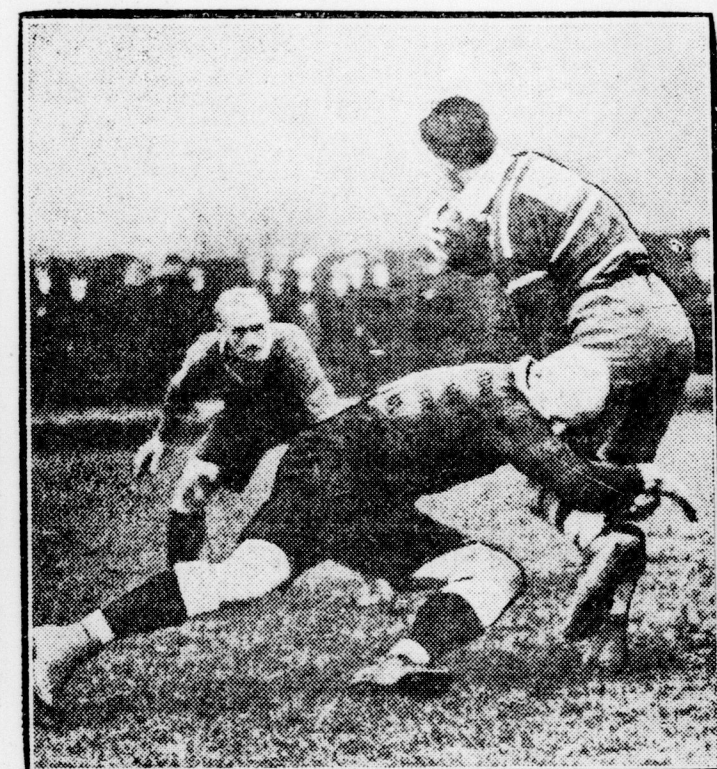
Many Famous old internationals played in Blackheath's team of veterans against the Bank of England in London recently. One of the ancients shows that he hasn't forgotten how to tackle