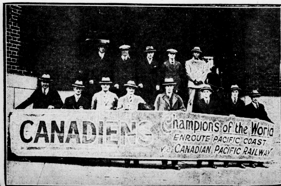
Members of the Canadiens, professional hockey team, are shown previous to leaving Montreal for Vancouver to play the western winners for the championship of the world