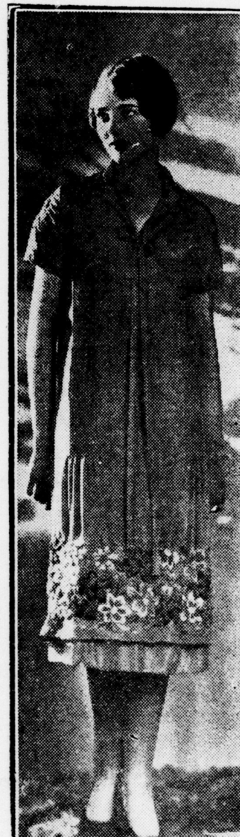
Embroidery plays an important part in the decoration of afternoon dresses for Easter wear. On this girlish dress of rust colored crepe a wide border of silk embroidery is most effectively employed