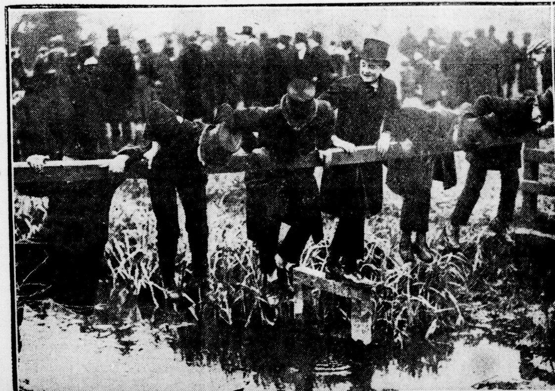
Eton boys clamber over the famous brook to watch the annual college steeplechase and incidentally to make sure of a good view when the competitors get a ducking