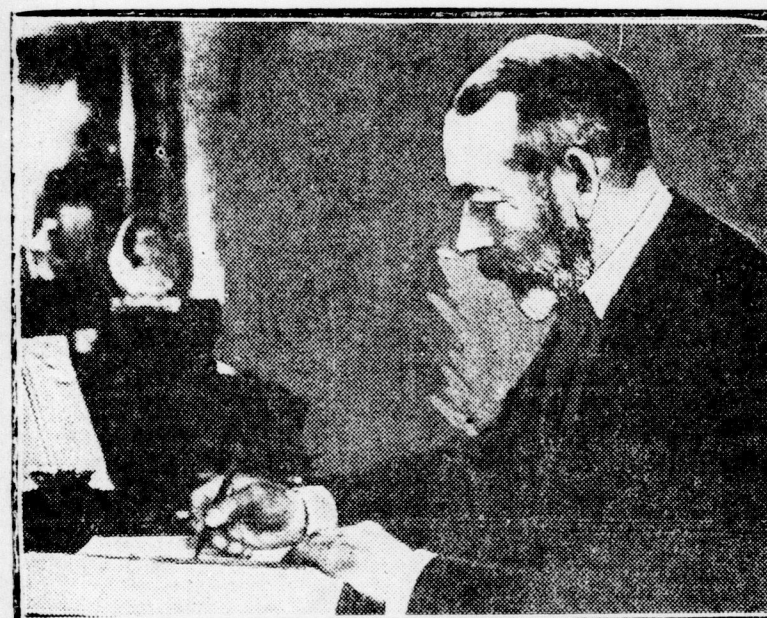
Here is the latest picture of King George, taken just before his illness, which confined him partly to his bed and to his private chambers under the watchful eye of his physicians