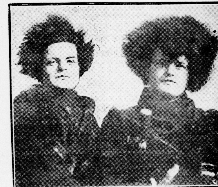
These young ladies recently astonished the boulevardiers of Paris with their novel haircuts, the Aurora Borealis on the left and the Lilifetche on the right. The coiffures need no hats to hold them in place