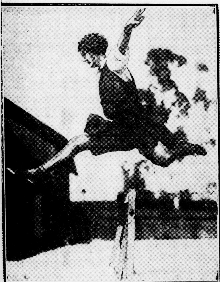
The University of California has certain specifications for the "normal young woman." Ability to take the hurdles is one of them. This young lady did all the stunts and added a bit to the requirements for good measure