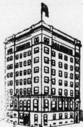
Head Office, Hamilton.

The following information may interest those desirous of opening a Savings Bank Account for the first time . . .