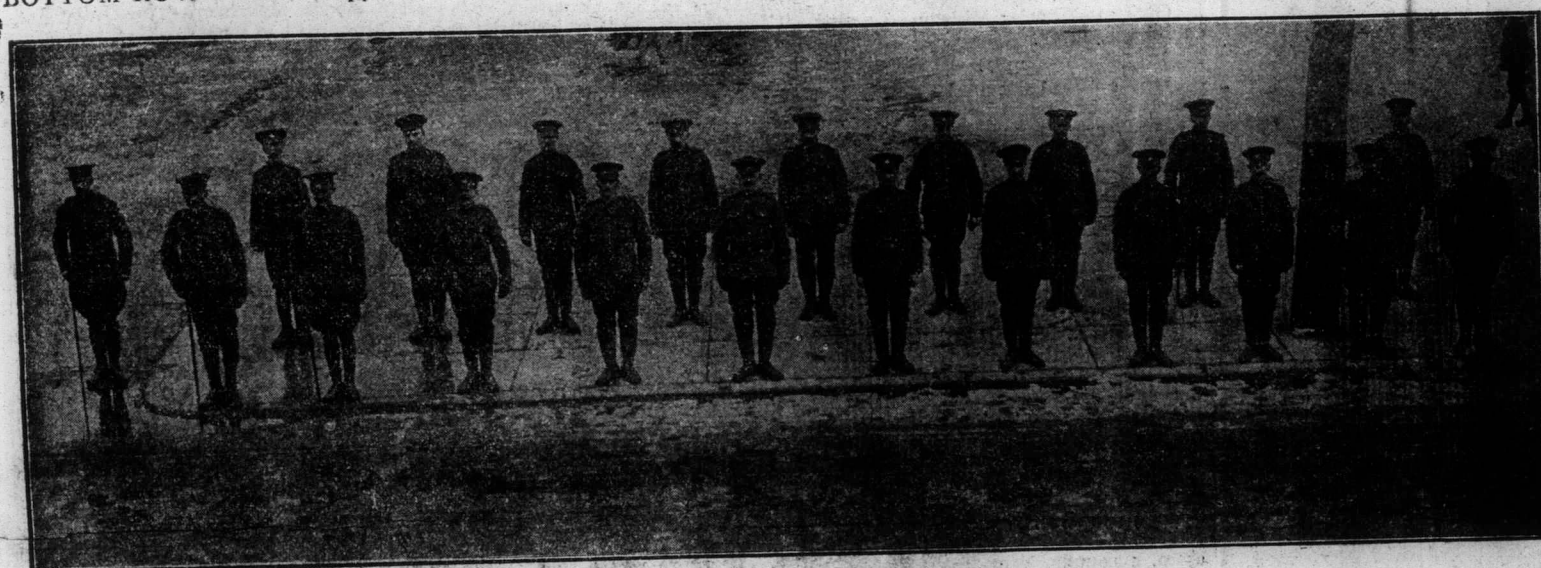
SERGEANTS OF THE 125TH BATTALION