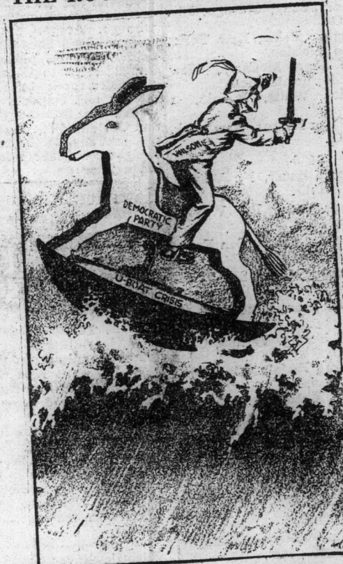
Coming and Going—Baltimore American, 1916.