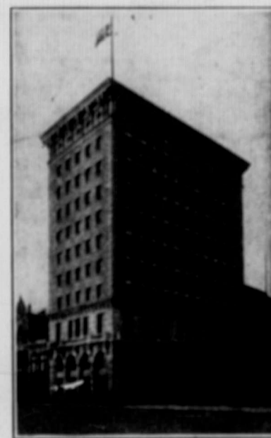
Head Office, Winnipeg