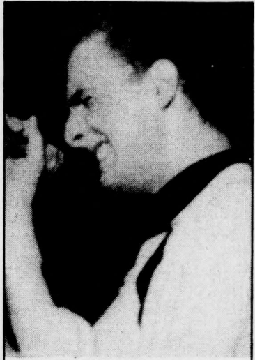
Blimkie looking for a reason

Considering that the band has only been together since last April (they were students of Music Production at Fanshawe