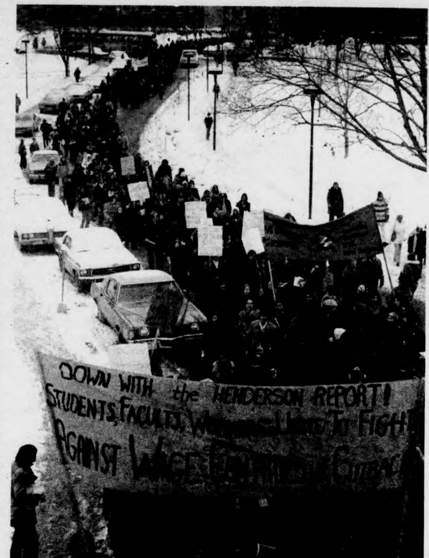
University and college students marching on Queen's Park.

There were chants of "They say cutback, we say fight back" and "Education is a right, fight fight fight fight" as the line of over 2,000 students headed towards Queen's Park.