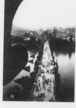
Charles Bridge and Ultava River, Prague