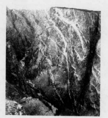
Painted Wall, Black Canvon of the Gunnison, Colorado