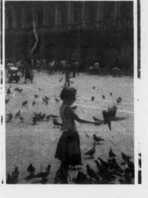
San Marco Square, Venice, Italy