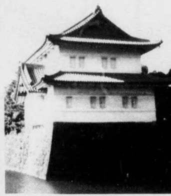
Emperor's Palace Gate House, Tokyo, Japan