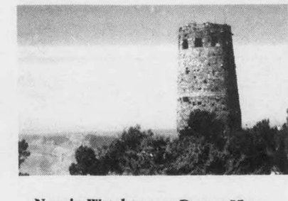
Navajo Watchtower, Desert View, South Rim, Grand Canyon, Az