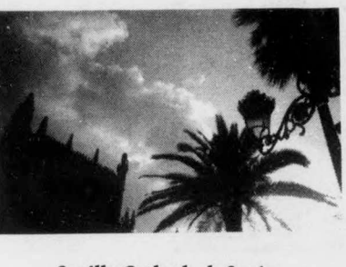
Sevilla Cathedral, Spain