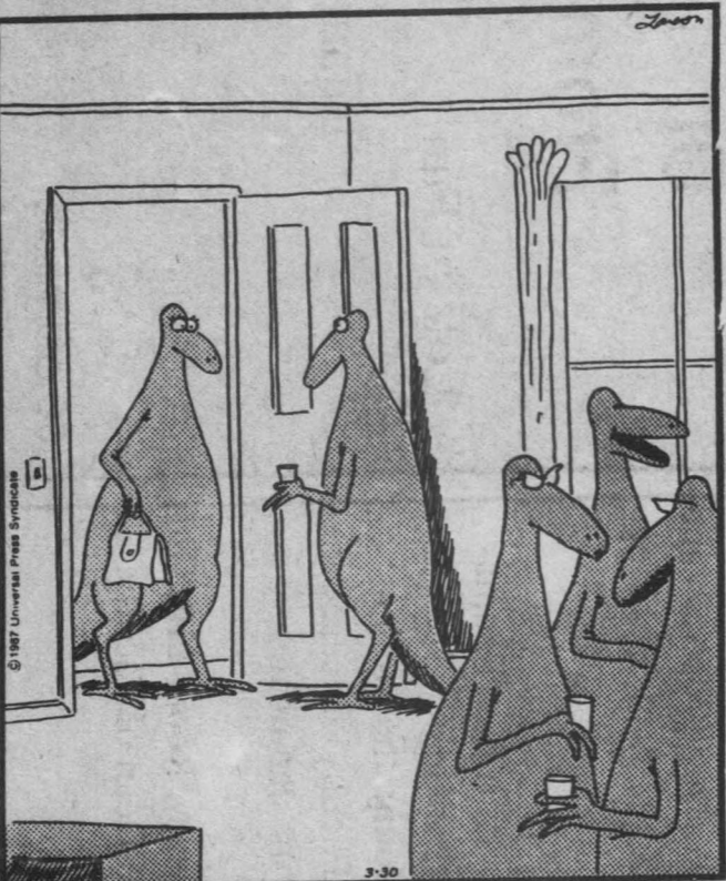
Chameleon faux pas: Arriving at a party in the same color as the host.