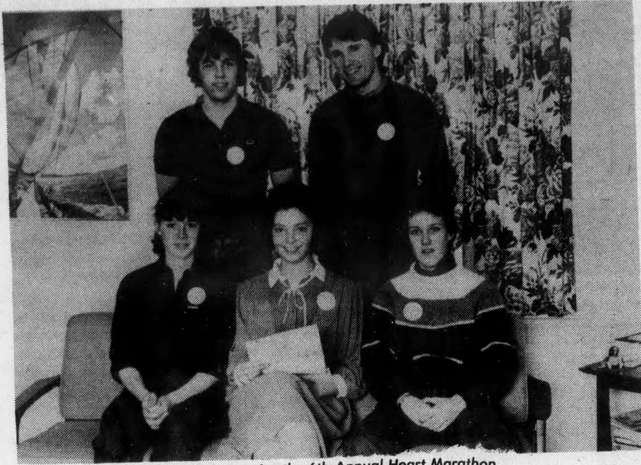
committee for the 6th Annual Heart Marathon.