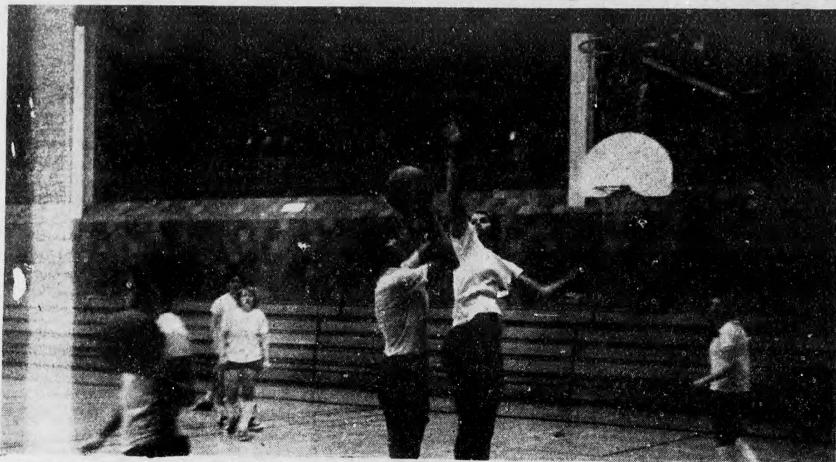
A member of the UNB Reds volleyball team is shown spiking the ball, in action during Tuesday night's league game.