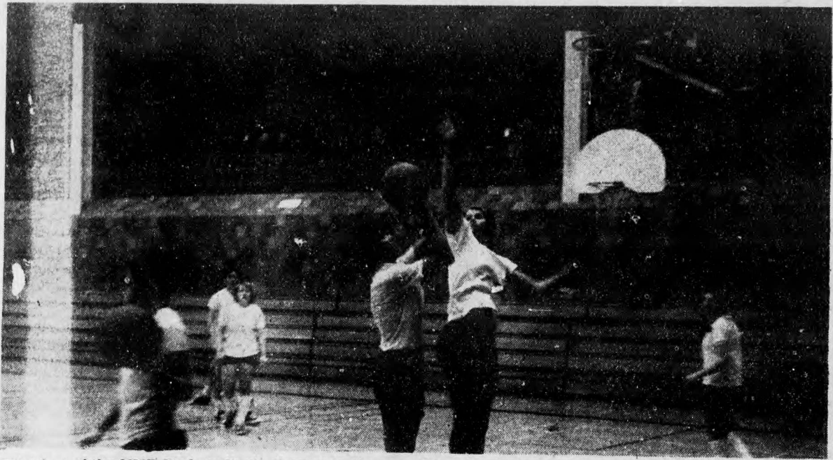
A member of the UNB Reds volleyball team is shown spiking the ball, in action during Tuesday night's league

On November 30 and December 1, the UNB Invitational will be held at the Lady Beaverbrook Gymnasium. Come and see the games and support