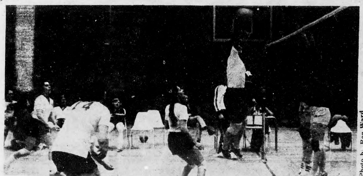
The Red Bloomers are working out constantly in preparation for their Invitational Tournament next weekend.