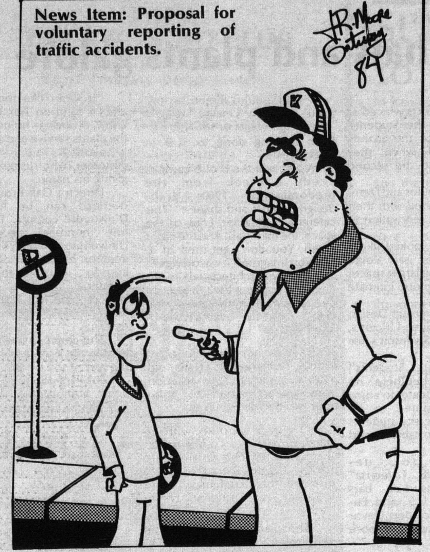
"The way I see it, it's your fault I totaled your car."