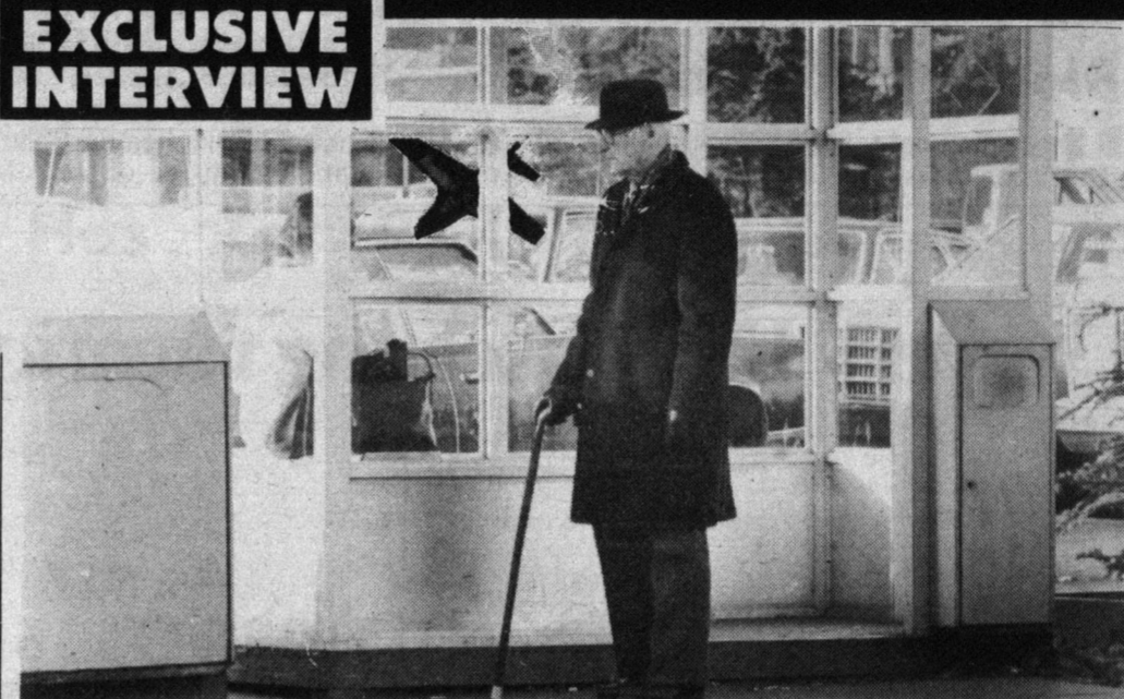
One of the many unsuspecting victims of the Moral Majority. "You will be struck by lightning or your will burn in hell or something like that."

The work they did was not unlike the work done in other cult organizations, like the Moonies.