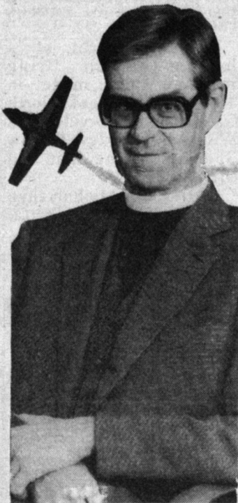
MM Agent number 99