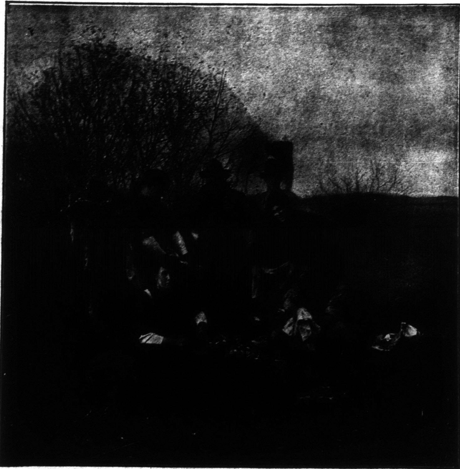
When the Boys Do Their Own Laundry

It was not long after this that a long, dark shadow crept out of the pine thicket behind the cabin and darted forward to a lone tree, where it seemed to melt into the shade behind the trunk. Then came another shadow, and another.