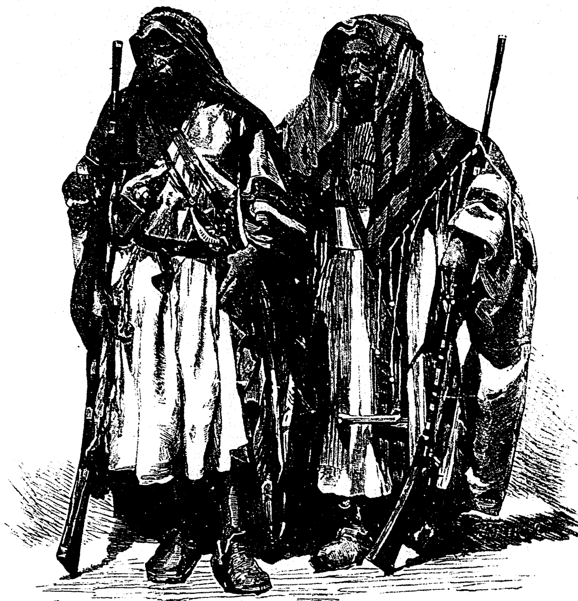
TYPES OF KROUMIRS.