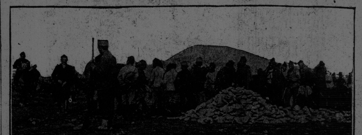
TURKISH PRISONERS AT PODGORITZA