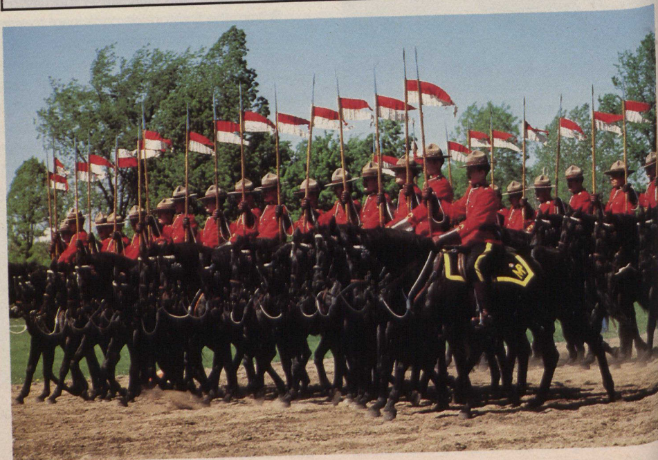
The RCMP Musical Ride is a popular daily event.