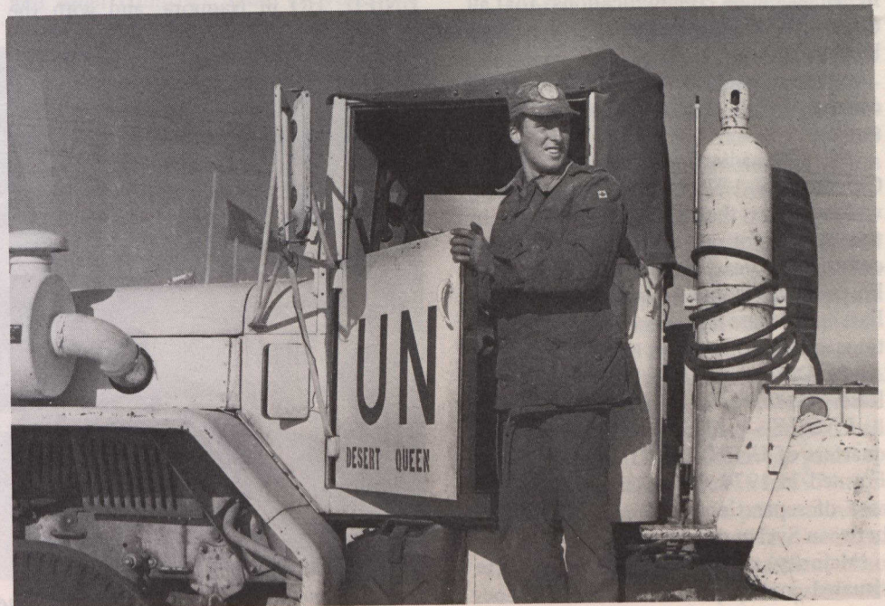
Canadian private about to enter United Nations vehicle in the Sinai Desert.

One-hundred-and-six years ago today... Parliament passed an act establishing the North-West Mounted Police, which became the Royal Canadian Mounted Police in 1920.