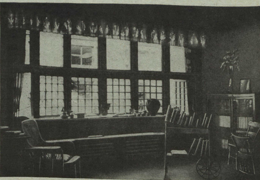
When a woman finds a book in "Sunwise Turn" that appeals to her, she seats herself in an easy chair and scans it through at her leisure. She is never asked to buy.

"At this end of the room we have grouped monographs of research in medicine and in psychology; in scientific agriculture and animal breeding; in civics and economics, and the more important contributions to feminism. Near the mosaic fireplace, with the textile draperies to attract (Continued on page 28.)