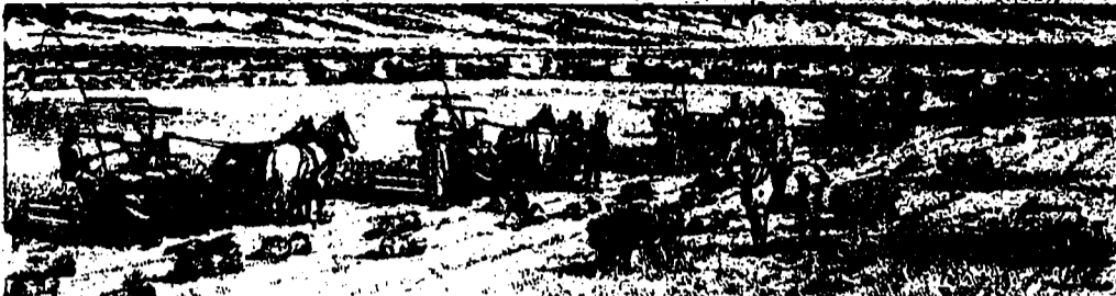
A GROUP OF WIDE-CUT MASSEY-HARRIS BINDERS AT WORK ON A PRAIRIE FARM, MANITOBA.

In these days it is not sufficient for a manufacturer to broadly state that his machine is "the best," and to illuminate his catalogue with pretty pictures of "the best" binder, without giving definite and conclusive reasons showing wherein his machine excels. Simple assertions as to superiority do not count for much unless backed up by practical and logical indications of genuine merit. The farmers of to-day are abreast of the times; they are wide awake to their interests; they now use implements so largely that they know what is and what is not an improvement in appliances calculated to lessen their labors, and they are quick to discern where real advance is made by the inventor of farm machinery.