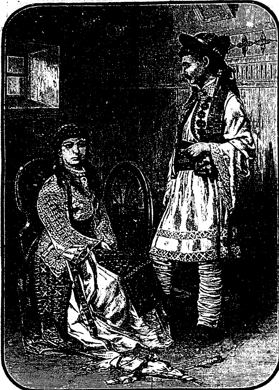
ROUMANIAN PEASANTS IN HOLIDAY DRESS.