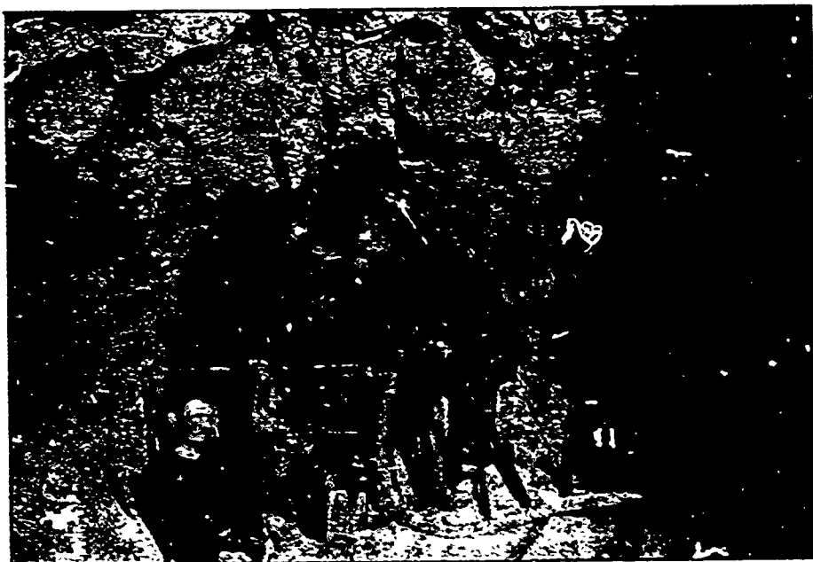
REPUBLIC No. 3, NORTH DRIFT.

recently taken out, gives a total of 3,000 tons that is ready on the dump for shipment to the smelter as soon as the railway is finished and ready to receive it. The ore recently extracted consists of two grades. The higher grade carries $1 in gold, six ounces in silver and 12 per cent. copper, or about $30 per ton. The second grade ore carries $1.50 in gold, three ounces in silver and six per cent. copper, or a total value of $15 per ton. The 3,000 tons of ore was all taken out during the progress of the development work. There has been no attempt made to stope any of the ore. It has been blocked out and left. This shows what large reserves of ore there is in the mine. Twenty men are now employed in the mine. A new 40-horse power boiler has just been installed. The plant, before this boiler was put in, consisted of a 30-horse power boiler, a 5-drill compressor, etc. This plant will be used until the new one is installed. The new plant will consist of two 50-horse power boilers, a 20-drill compressor and a new