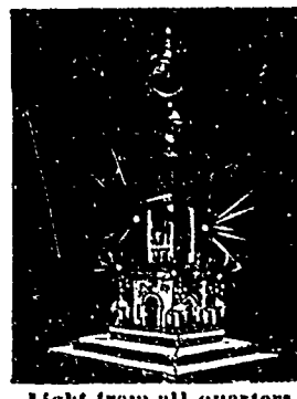
Light from all quarters

Buckeye Bell Foundry J. W. Ginduzen Co., Cincinnati, Ohio Best Pure Copper Church Bells & Chimes. Highest Award at World's Fair, Gold Medal at St. Louis 1892. In Price, terms, etc., supplied free